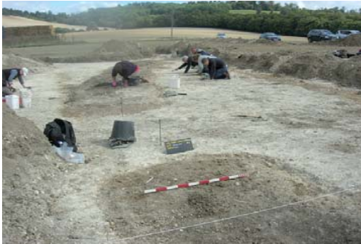
Meticulous work at the henge, August 2012